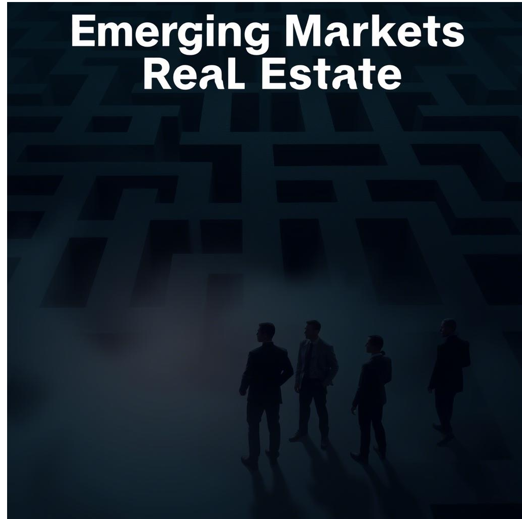
Image of a dark maze labeled "Emerging Markets Real Estate" vs. a sleek AI model crashing.